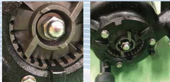
Grinder ring and impeller