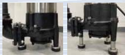
Without sleeve With sleeve